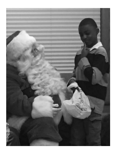
Signing Santa at the Family Christmas Party