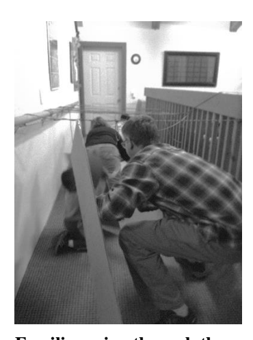
Families going through the obstacle course with their shields of faith during the Nerf