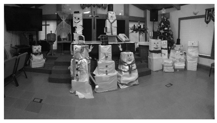
Families worked together to build snowmen during the Family Christmas Party